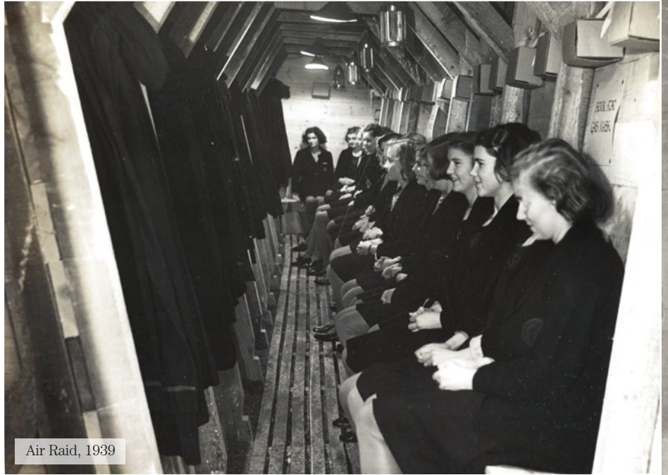
Air Raid, 1939