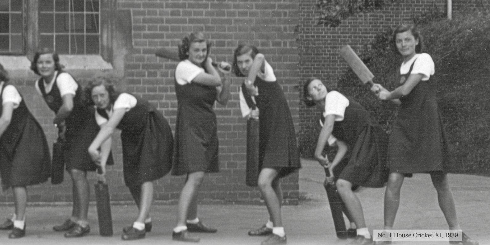
No. 1 House Cricket XI, 1939