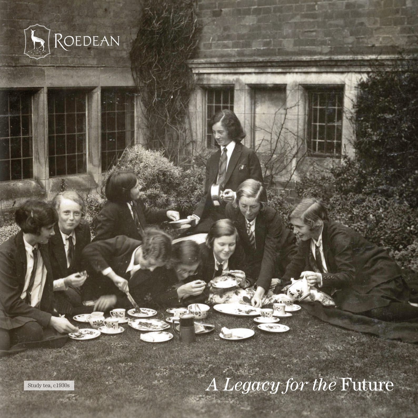
Study tea, c1930s